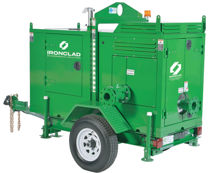
*Photos are representational; actual products vary. Additional product plans and specifications may vary from those shown and are subject to in-stock availability.

Our 6" sound attenuated pump operates at or below 70dBA for quiet, efficient running. As a solids handling jet pump, it's designed for high flows to 2,700 gpm and heads to 195 feet. Our quick self-priming pump eliminates the need for a waste hose and the need to fill up the pump housing with water to obtain prime. It also prevents discharge of pumping effluent onto the ground. In addition, our Tier IV diesel engines reduce emissions.